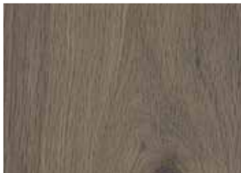
CAVARI BLANC AVC-2004