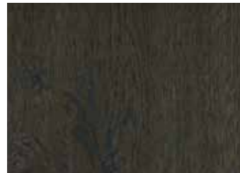
PROVENCAL BRUN AVC-2014