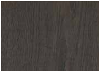
PALAIS NOIRE AVC-2013