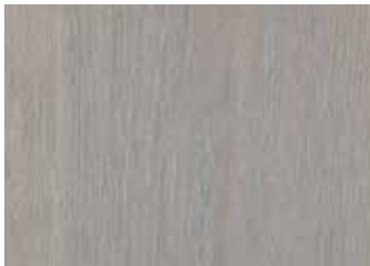
CAVARI WASH AVC-2003