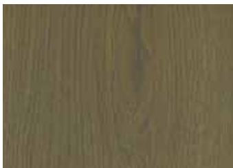
CAVARI ASH AVC-2001