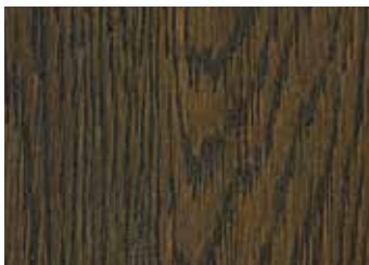
MISTRAL EBONY AVC-2012