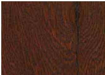
MISTRAL AMBER AVC-2011