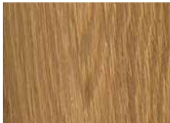
CORSICA CLEAR AVC-2006