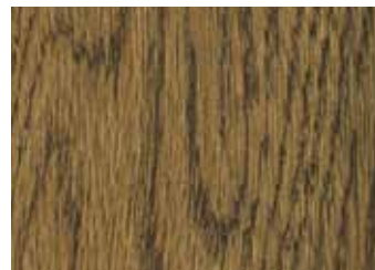
GRENOBLE SMOKE AVC-2016