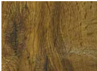
PROVENCAL SMOKE AVC-2005